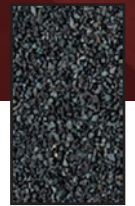
Thunder Black TSP654529

Product Composition and Features: TopShield® PRO modified bitumen membranes are manufactured on state-of-the-art, dedicated roofing lines that were exclusively designed for the production of modified bitumen products. TopShield® PRO APP-G is produced with a high performance, stress-resistant polyester mat that is impregnated and coated with a superior grade, modified bitumen compound.